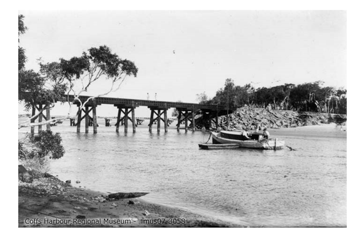
Figure 5a. Unidentified people standing on the railway bridge ~1925 (Photo courtesy of the Coffs Harbour Regional Museum).

The reason it silted up was because they shortened the span, they put the new bridge in and they shortened the span up one or two spans, and with that, silted the bloody creek up. Before that it was quite good...used to be 20 foot of water there...little 20 footers [vessels] used to go up under there and that is why the [old] bridge had a hump in it, cause they used to drop their masts and they'd go under it. Lionel Innes, Recreational Fisher.