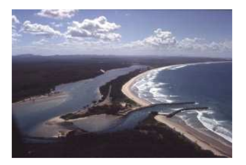
Figure 6b. Wooli Wooli River with the current breakwall, 2012.

There were no reports from any participant that the rivers were getting deeper over time, but two participants mentioned shifting sands, as opposed to increasing sediment in rivers, causing channels to move. One recreational fisher in Wooli, Richard Taffs, noted a benefit with increased sedimentation, stating "In terms of change, one of the positive things, as a lover of mangroves is we're seeing an increase in the mangrove population because the sedimentation actually favours them".