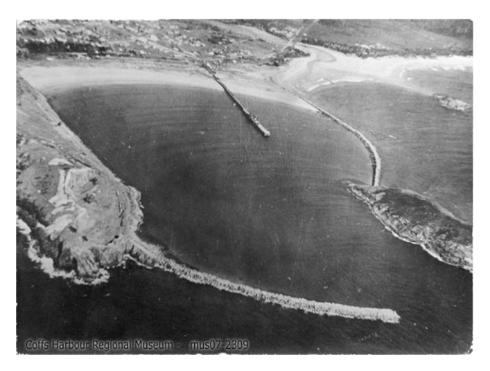
Figure 3a. Early construction of the northern breakwall in ~1926, showing Park Beach (south) and Coffs Creek mouth (Photo courtesy of the Coffs Harbour Regional Museum).

Figure 3b. Aerial view of the harbour in 1946, including Park Beach (south) and Coffs Creek mouth (Photo courtesy of the Coffs Harbour Regional Museum).