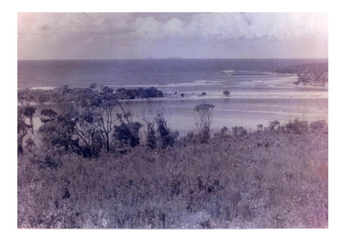
Figure 6a. Wooli Wooli River mouth before the breakwall was built (Photo courtesy of Bob Howard).

The Wooli Wooli River was also mentioned by several participants as a river that has silted up. Commercial fisher and long term resident Bob Howard said "the fact that the breakwall is there, the river doesn't flow like it used to and all the big deep holes have gradually silted up, the sand boils up with the waves on the bar and pushes in with the run-out tide, but only about ninety-eight percent of that comes out, so over a period of time those holes do silt up". He also mentions the influence of droughts and flooding rains on sedimentation over the years. Bob mostly refers to the Wooli breakwall as a contributing factor to sedimentation in the downstream region of the river but acknowledges the role the breakwall, which was completed in 1972, to cater for an expanding fishing fleet in the port of Wooli (Figures 6a and 6b). The Wooli Wooli River catchment falls almost entirely in Yuraygir National Park and is therefore not impacted by large scale development, industry or other adjacent land uses.