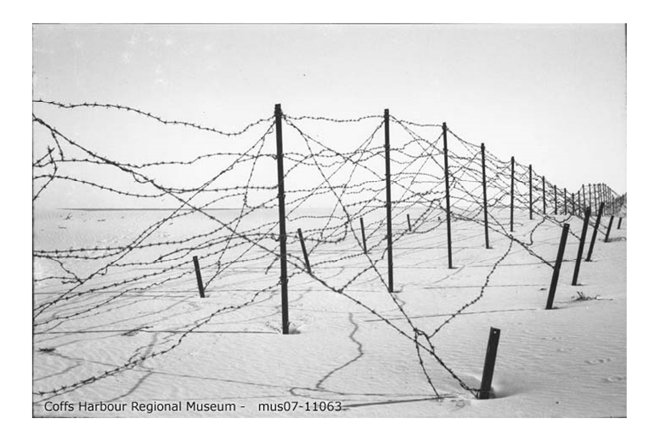
Figure 4. Barbed wire placed on Park Beach and across Coffs Creek during World War II (Photo courtesy of the Coffs Harbour Regional Museum).

Uncle Mark Flanders recalls growing up on Coffs Creek as "probably some of the greatest moments in my life" and described Coffs Creek as "much deeper back then". He attributes the change in the creek and increased sedimentation to surrounding development "they discovered concrete in the eighties (1980s) and they haven't stopped, development went crazy". Coffs Creek was the subject of most comments regarding the siltation of estuaries. Coffs Creek has, and continues to be, an area of high use by many people for varied activities and therefore changes are more likely to be reported in this location. Local long-term resident and surf lifesaver John Mills recalled as a youngster in the 1930s catching "50 or 60 prawns [in Coffs Creek] in your two hands, they were that thick" but now acknowledges "the creek is a lot different to when I was a young bloke...it was deeper than 10 feet of water, you'd walk across on your knees now". Interestingly, he also witnessed the placement of barbed wire along Park Beach and Coffs Creek during World War II due to the heightened risk of Japanese attack (Figure 4) and believes this "stopped the flow of the creek for a year or two".